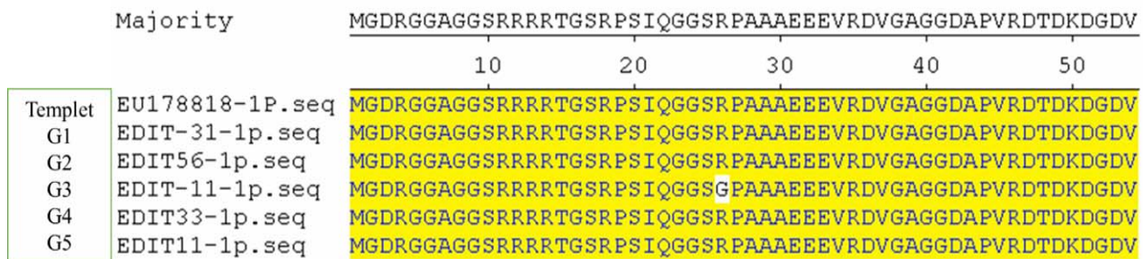
Figure 3 The amino acid sequence of exon-1 of DGAT1 gene for Lori-Bakhtiari and Zel breeds

The means within the same row with at least one common letter, do not have significant difference ( P>0.05 ). SE: standard errors.