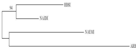
Figure 3 Genetic relationships among the 4 sheep breeds using R_D genetic distance

All four sheep populations had a substantial amount of genetic variation, and none of them can be considered genetically impoverished. The different F_{IS} values of the populations reflect different levels of inbreeding (Pariset et al. 2003). Overall inbreeding in the four breeds are lowest ranked is Arb. The three sheep populations (Najdi, Hbsi and Naemi showing the highest level of inbreeding should be considered to be at risk as this condition can lead to reduced fitness (Table 1). This finding could be due to population subdivision in each region, local inbreeding or the presence of null alleles (Peter et al. 2007; Handley et al. 2007; Gustavo et al. 2000).